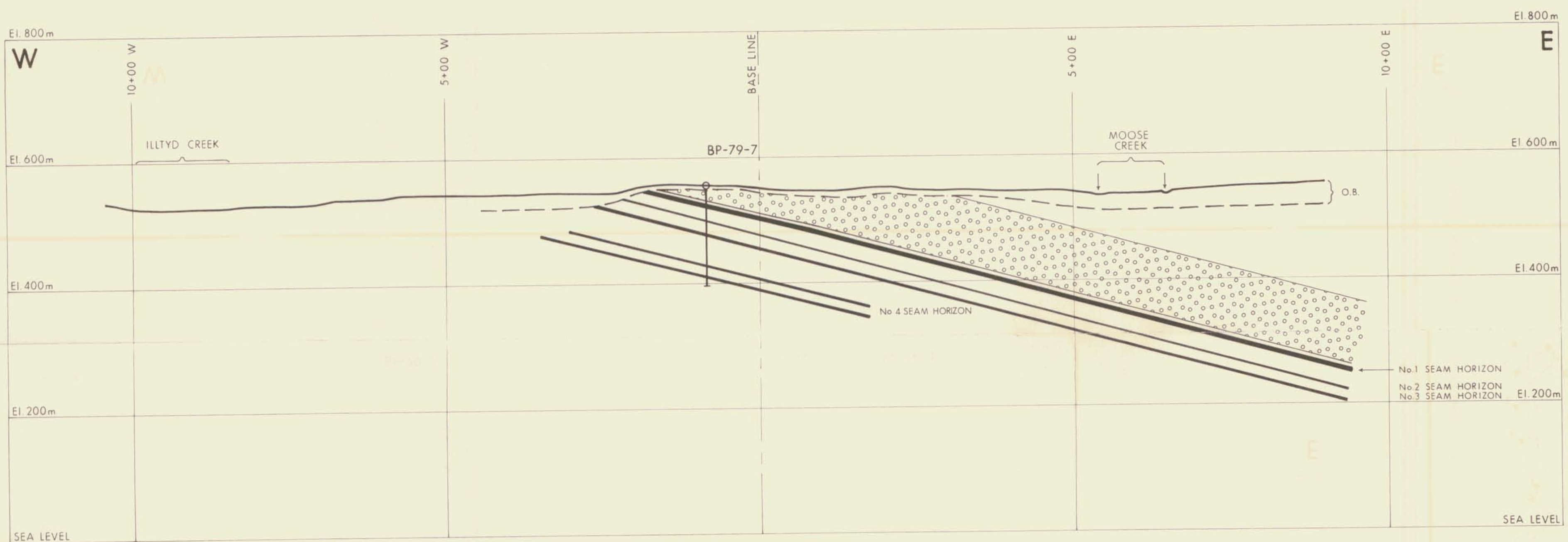
B-B' SECTION THROUGH LINE 35+00 N