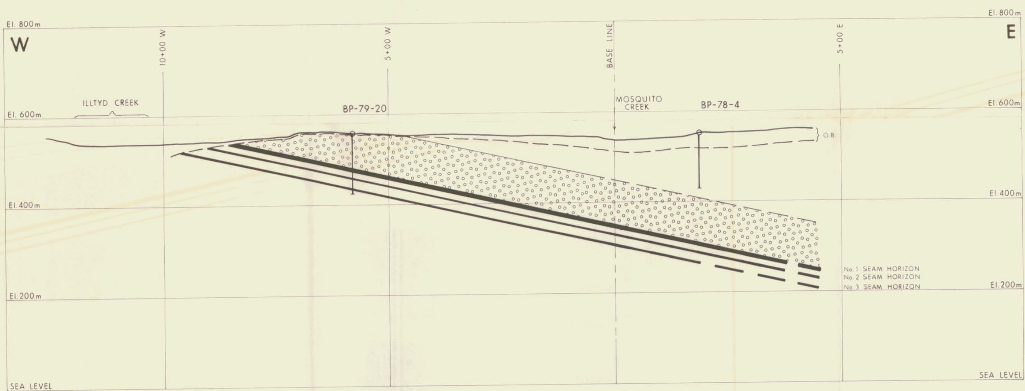
D-D' SECTION THROUGH LINE 25+00 N