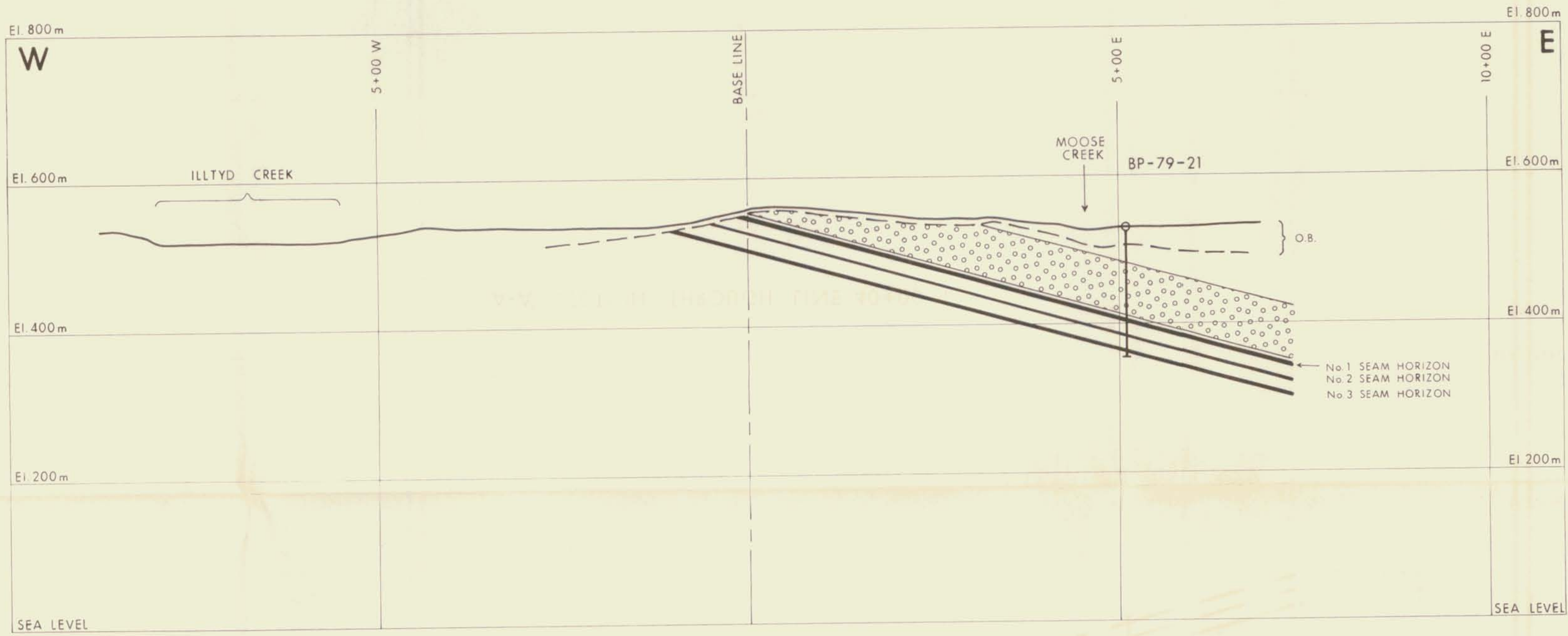
A-A' SECTION THROUGH LINE 40+00 N